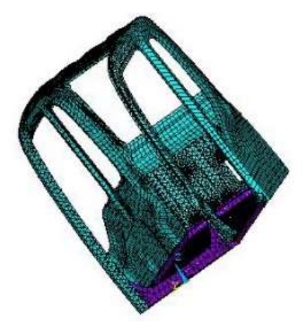
Figure 1. Example figure

To ensure good quality of the published paper, doublecheck the quality of all graphics. Do not use very thin lines or very small fonts in figures. Make sure that the axis nomenclature in figures is homogeneous and readable (see Fig. 2).